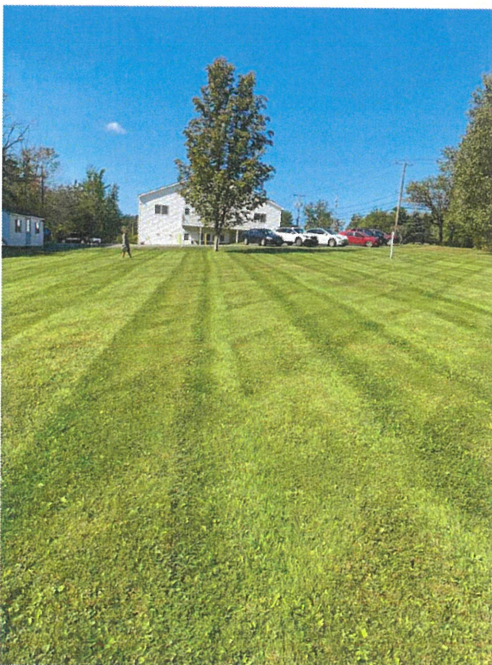
Proposed site looking North

The proposed turbine will offset the Town Hall's electricity demand with clean, carbon-free electricity. The Energy Committee will present the full scope of the project at this meeting.