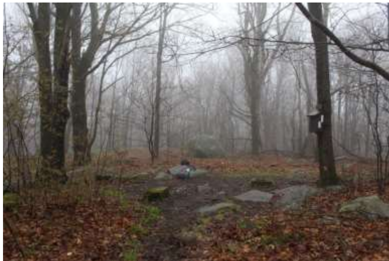
Former site of Fire Tower on AT in Becket

For further information email the Becket Historical Commission: