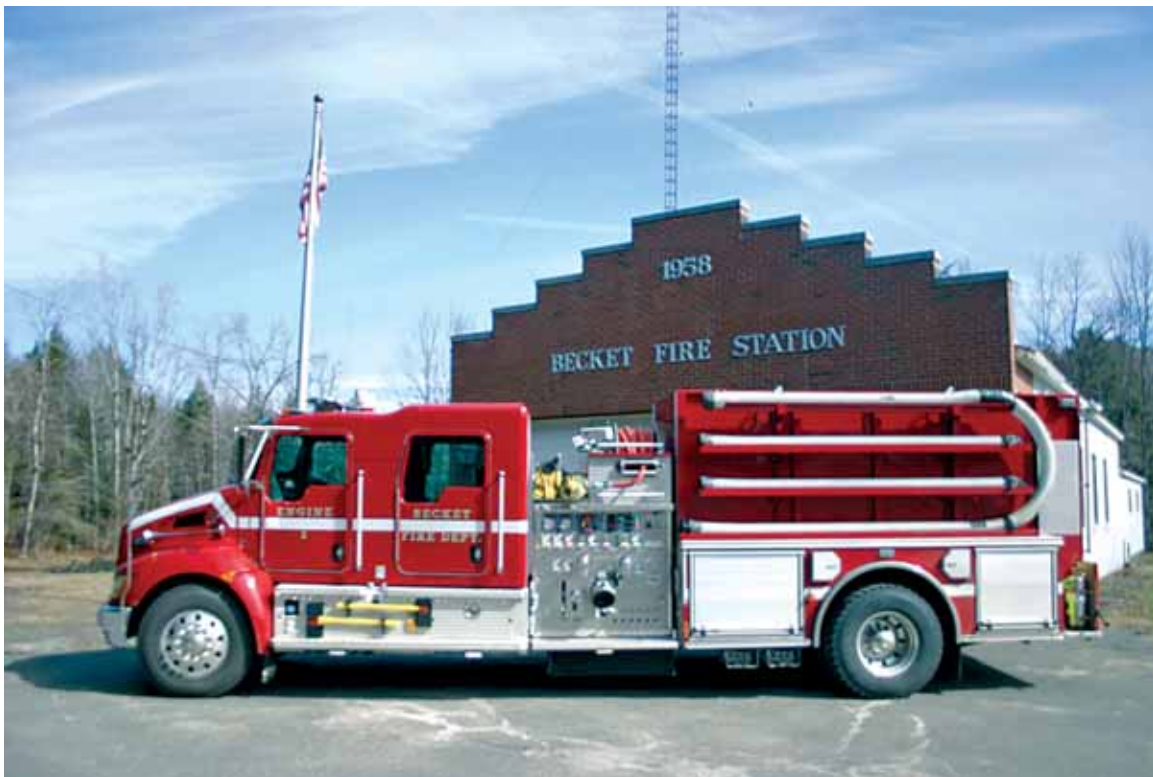
The Newest Apparatus for Fire Station #1