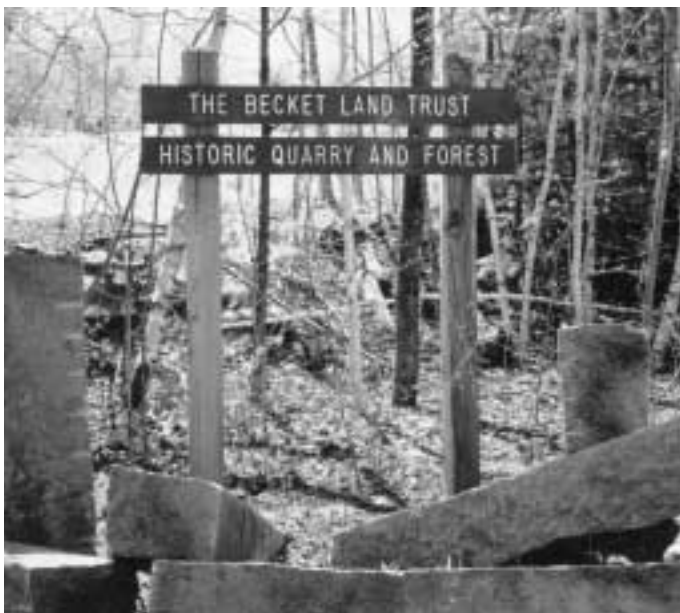
Left, the informational kiosk, and above, the sign at the Quarry. Top right, a map of the Quarry property showing this year's trail work progress.