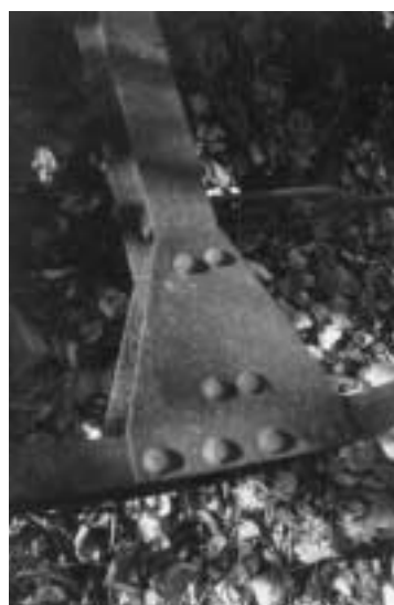
Drawing and photo showing a detail of the derrick's bull-wheel which we have documented in technical drawing format as part of our historic research. This work precedes the reparative efforts taking place this summer.