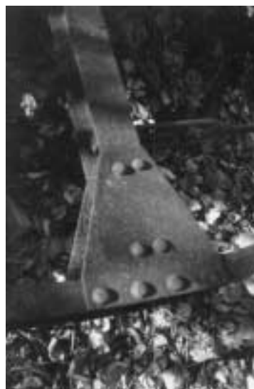
Drawing and photo showing a detail of the derrick's bull-wheel which we have documented in technical drawing format as part of our historic research. This work precedes the reparative efforts taking place this summer.