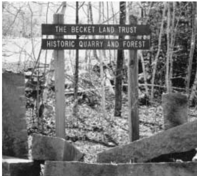
Left, the informational kiosk, and above, the sign at the Quarry. Top right, a map of the Quarry property showing this year's trail work progress.